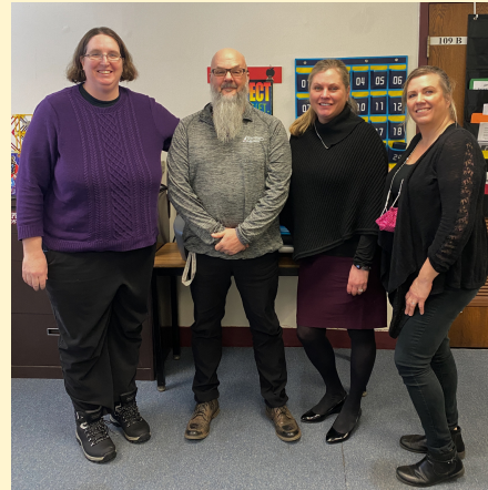
Staff and Students featured in episode two of the Tour of Lake County Featuring Fairport Harding High School